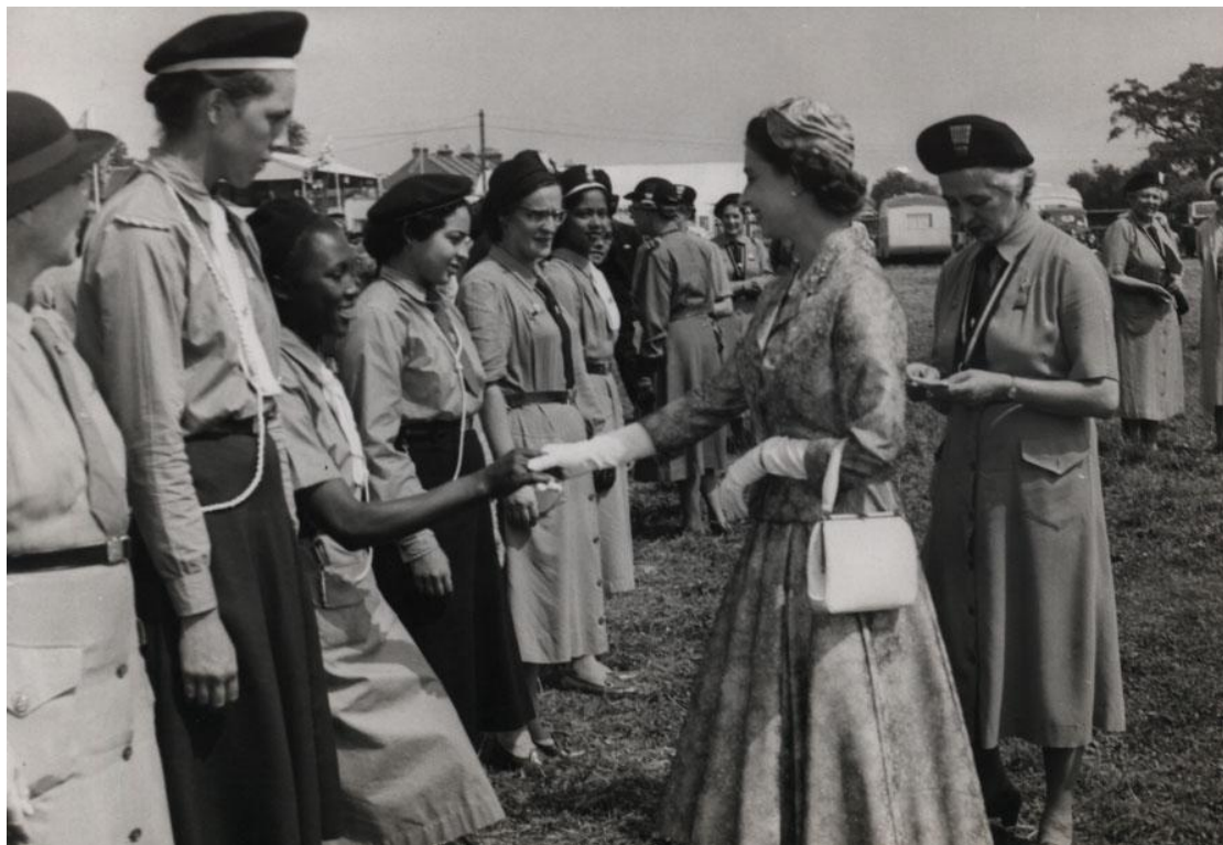
H.M. The Queen at Windsor

The camp was divided into ten sections, with each section split into eight groups. Each group name had a connection with BP. Each camper wore a disc which was two thirds section colour and one third group colour. The Camp was officially opened on Tuesday 30 th July by the World Chief Guide Lady Baden-Powell. H.M. The Queen and H.R.H. The Princess Royal visited the Camp on Sunday 4 August.