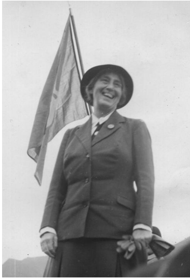
Rally at Ulrichen. Lady BP

Collectables known to have been issued :-